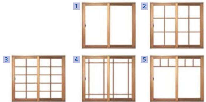
1 Standard 2 Colonial Bar 3 Multi Colonial Bar 4 Federation Bar 5 Heritage Bar