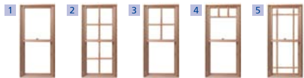
1 Standard 2 Colonial Bar 3 Colonial Bar 4 Heritage Bar 5 Federation Bar

The Jambliner system allows the sashes to be quickly tilted or removed for easy cleaning and for painting or reglazing. The sashes easily snap back into position, resuming normal vertical operation without compromising security.